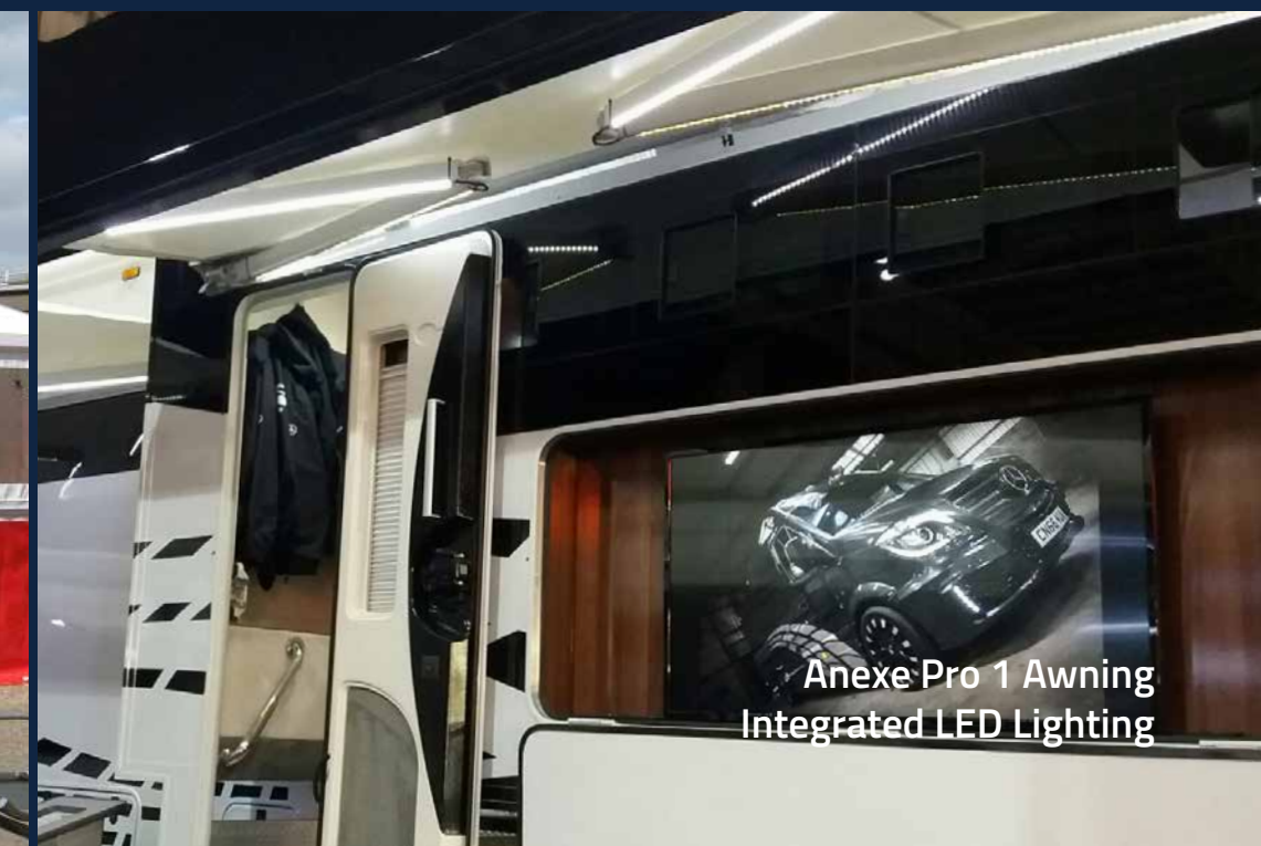
Anexe Pro 1 Awning Integrated LED Lighting