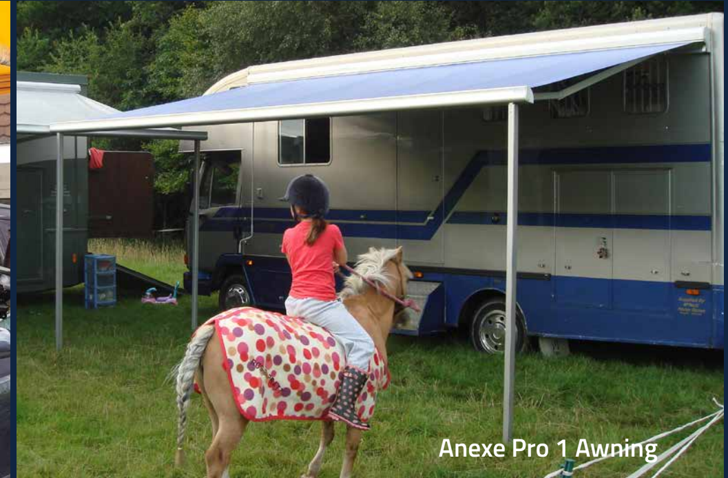
Anexe Pro 1 Awning