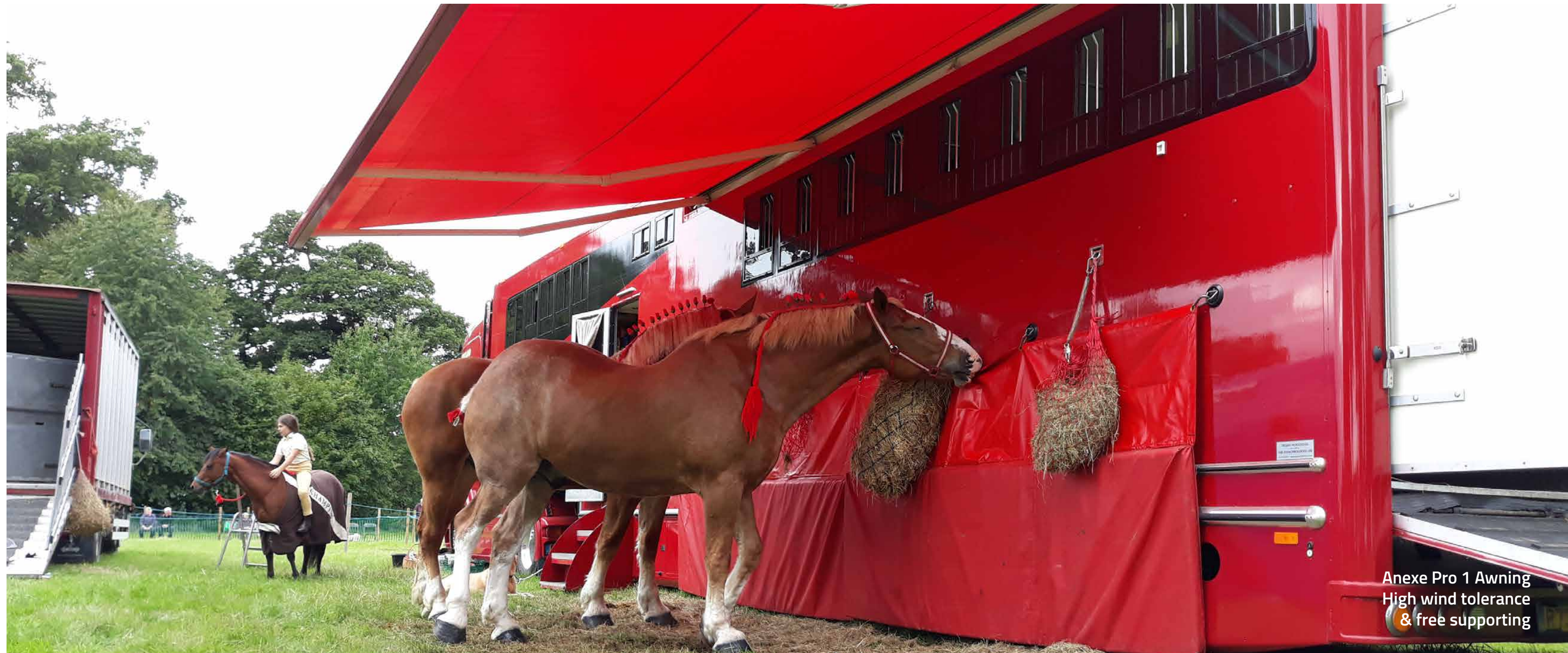
Anexe Pro 1 Awning High wind tolerance & free supporting

Your Anexe Pro 1 can be supplied as built in, roof mounted or with standard surface mounted fixing options.