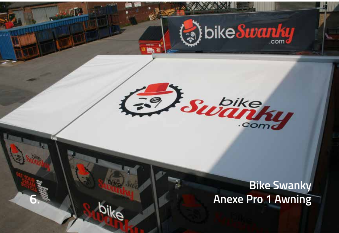
Bike Swanky Anexe Pro 1 Awning

Our hand selected Italian fabric textiles to M2 Flame Retardant standard are of the highest quality and lacquered for longevity in 30 colours offering matt or satin vinyls. Guaranteed not to fade, rot or crack no matter what the environment. Construction using the latest high frequency welding techniques minimises the use of sewing therefore increases the waterproofness of joins.