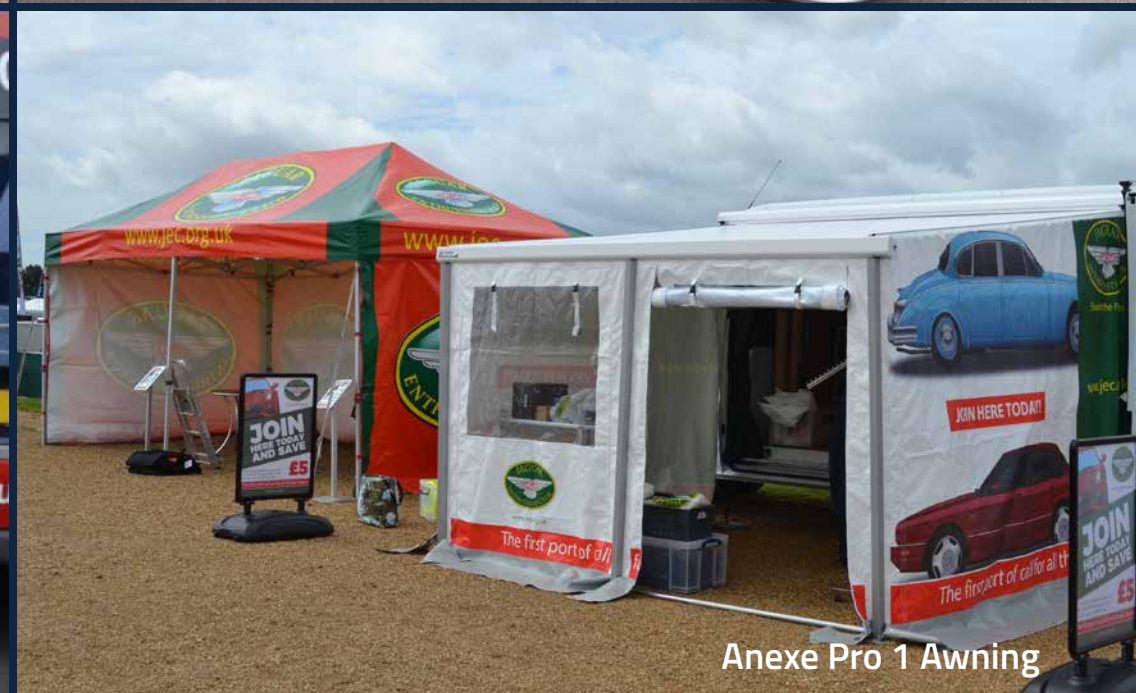
Anexe Pro 1 Awning

57 Hatch Pond Rd, Poole, Dorset, BH17 0JZ, UK