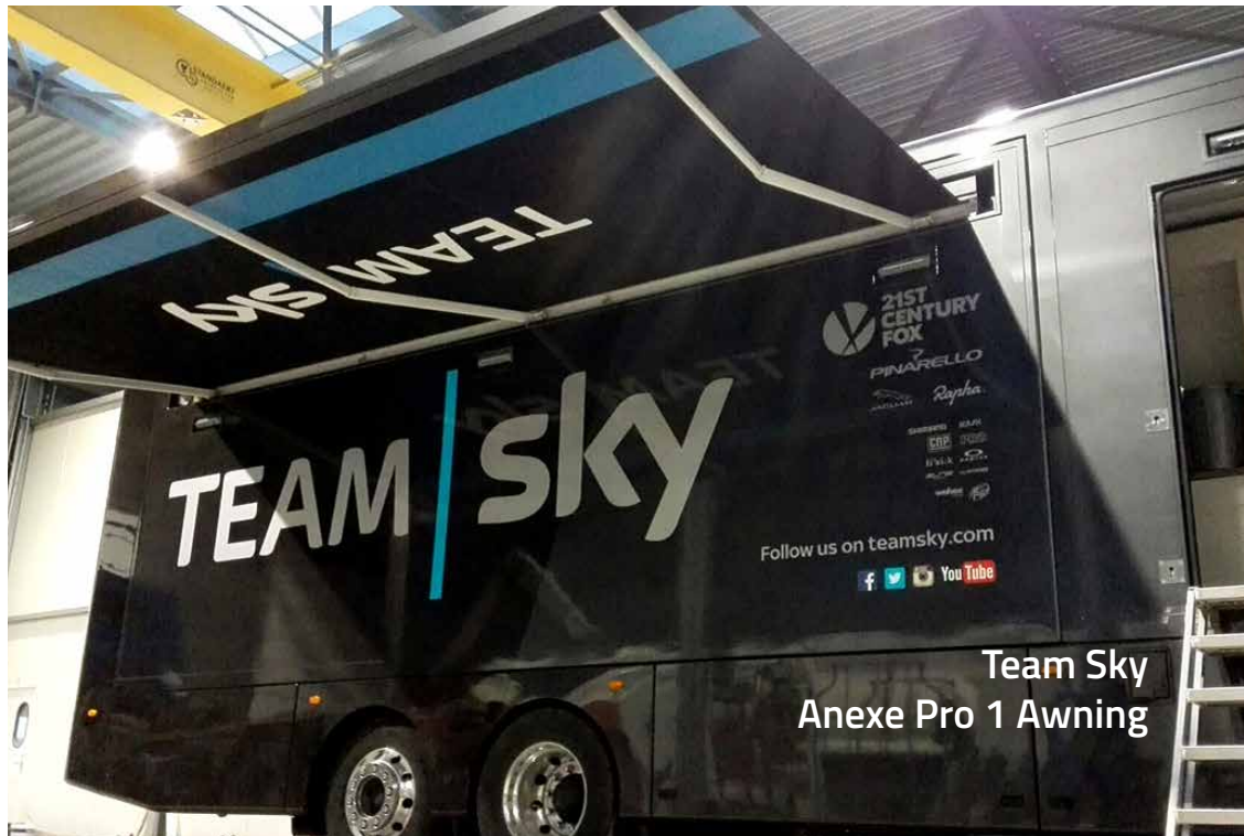
Team Sky Anexe Pro 1 Awning