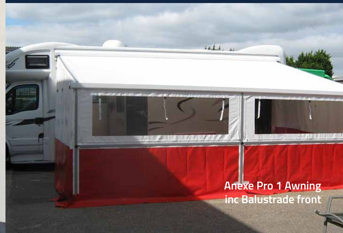
Anexe Pro 1 Awning inc Balustrade front

Choose Anexe Pro 1 for your motorhome - a class above the rest. 21st century awning design with optional motor operation and integrated LED lighting is sure to compliment the finest of motorhomes. Extend your living and work space, or create a social area to relax or work on bikes. You can choose from custom built awning cassettes and components in a choice of standard hardware colours, optional tailored sides and front enclosures with personalisation such as windows and vehicle skirting. For the constructor, we offer a built-in system recessed in the side if preferred.