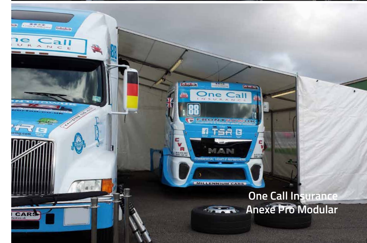
One Call Insurance Anexe Pro Modular