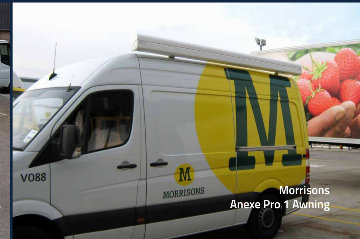
Morrisons Anexe Pro 1 Awning