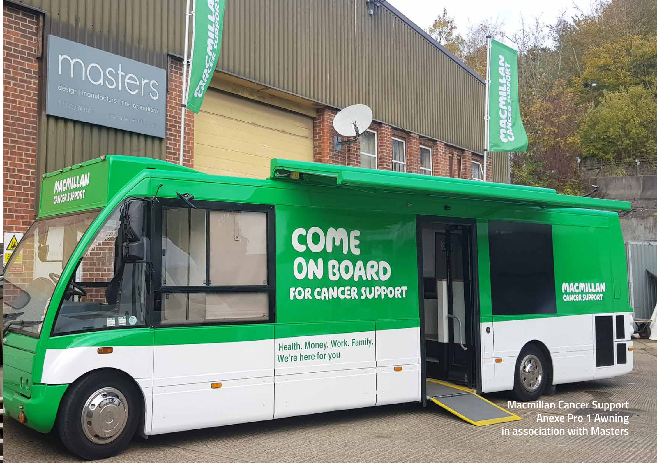
Macmillan Cancer Support Anexe Pro 1 Awning in association with Masters