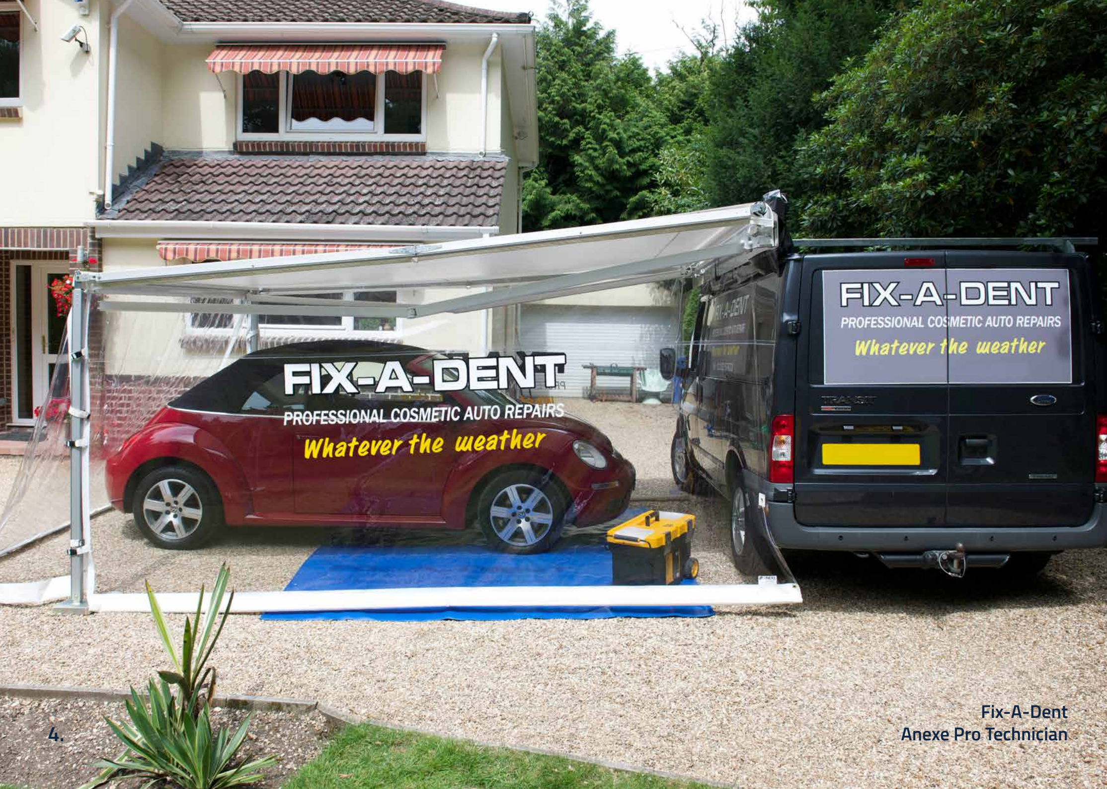
Fix-A-Dent Anexe Pro Technician