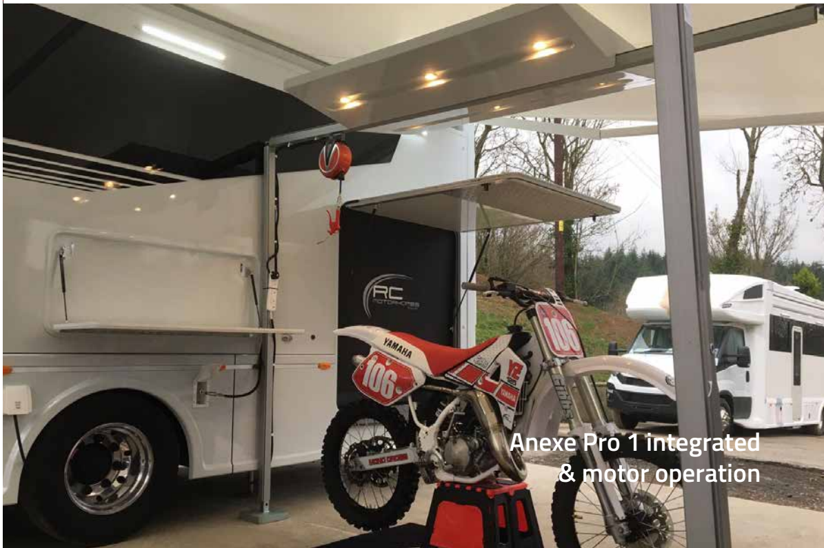
Anexe Pro 1 integrated & motor operation