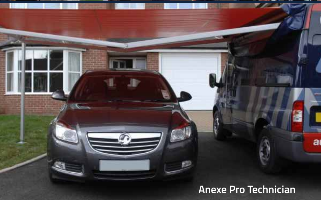
Anexe Pro Technician