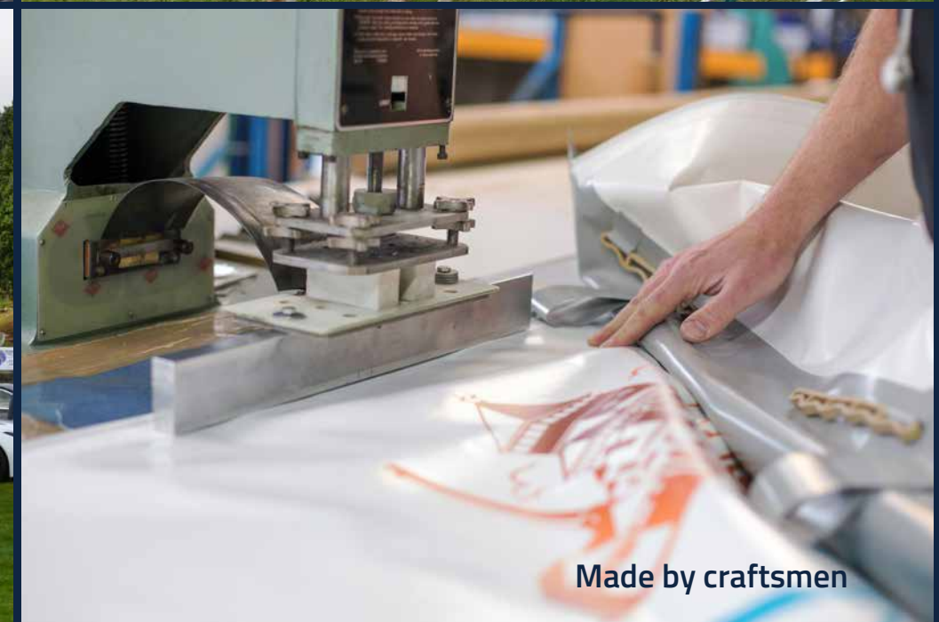
Made by craftsmen