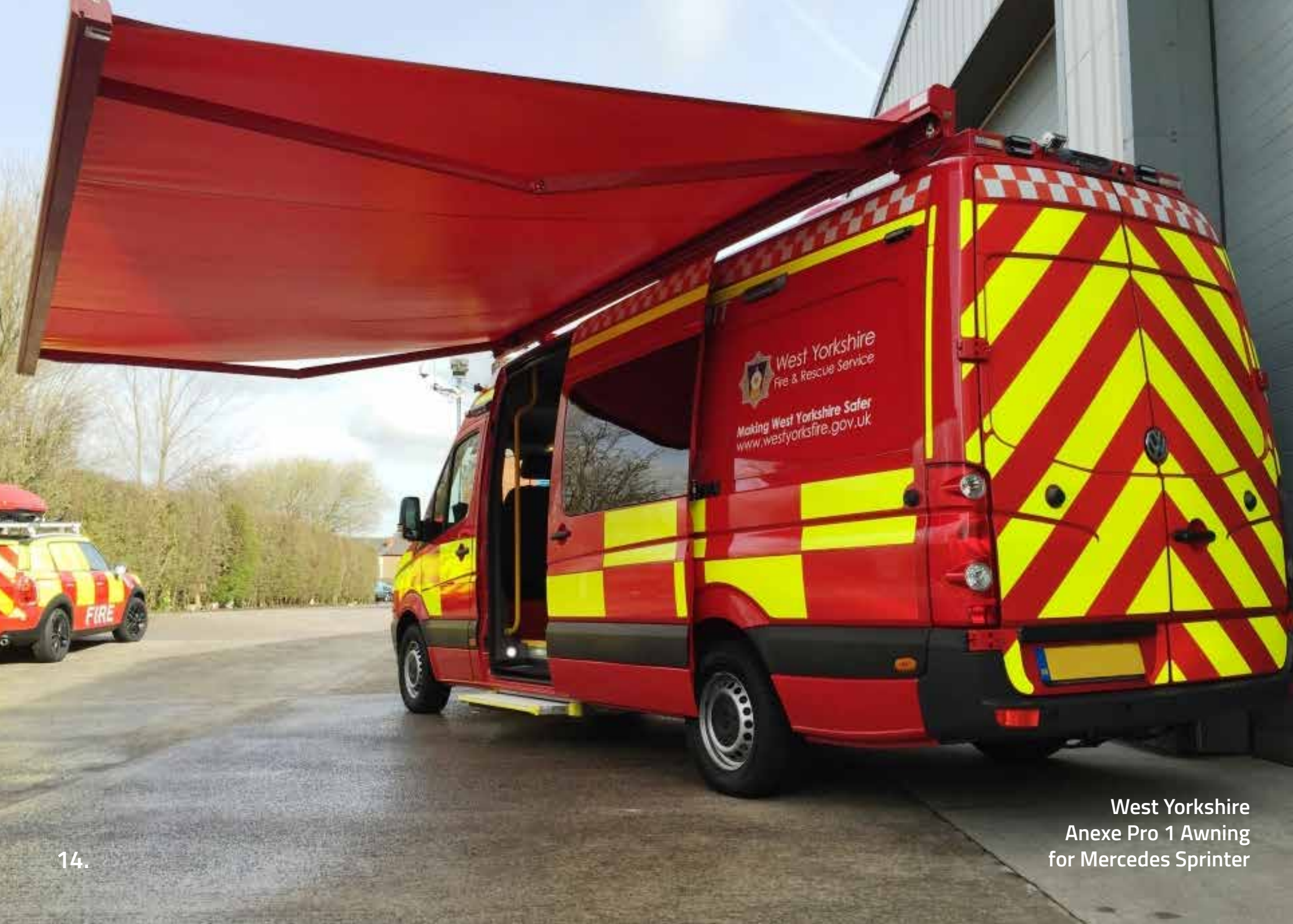
West Yorkshire Anexe Pro 1 Awning for Mercedes Sprinter