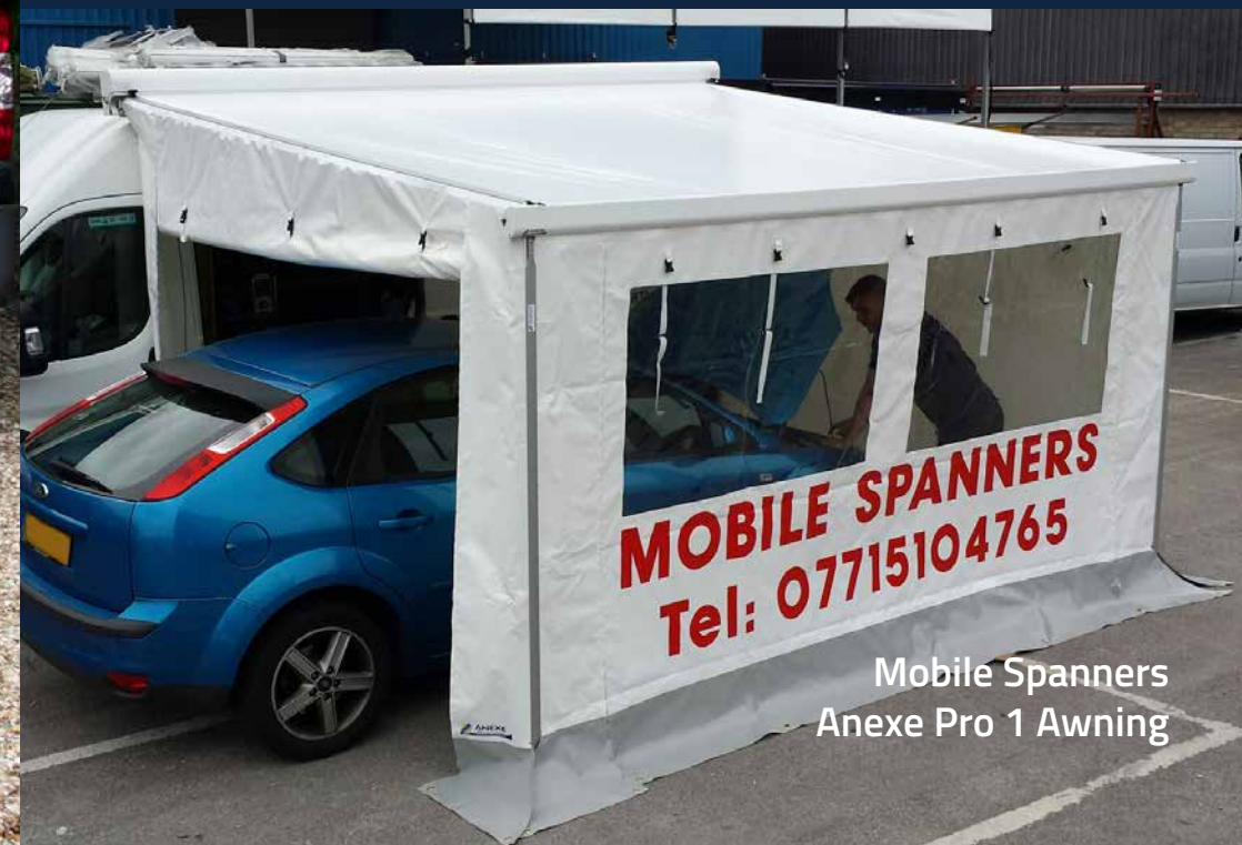
Mobile Spanners Anexe Pro 1 Awning

Pro Technician or Pro 1 Technician systems are available for most van types and a special roof mounted system is available to fix either to your roof rack mounting points or to your own roof bars.