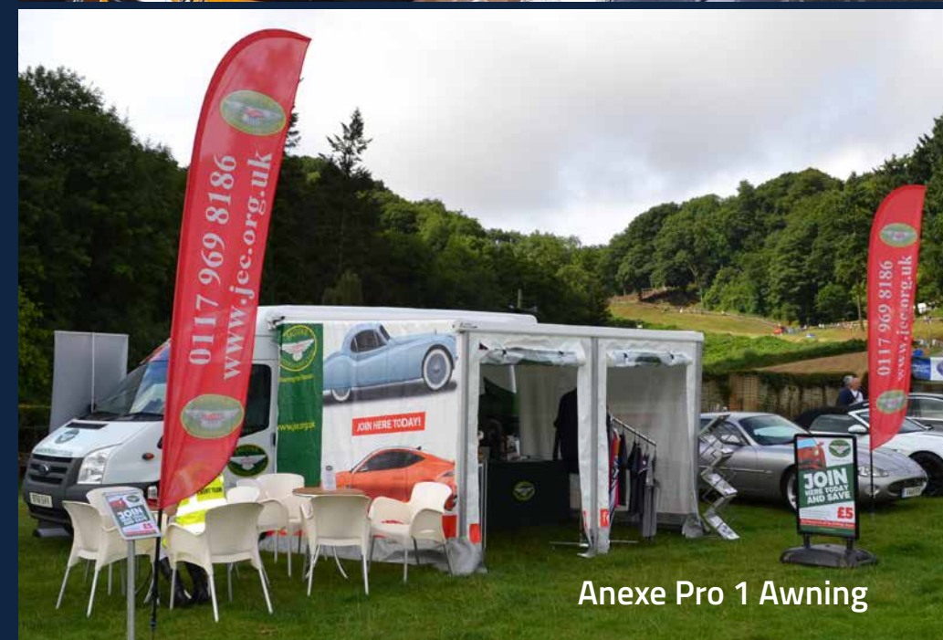
Anexe Pro 1 Awning