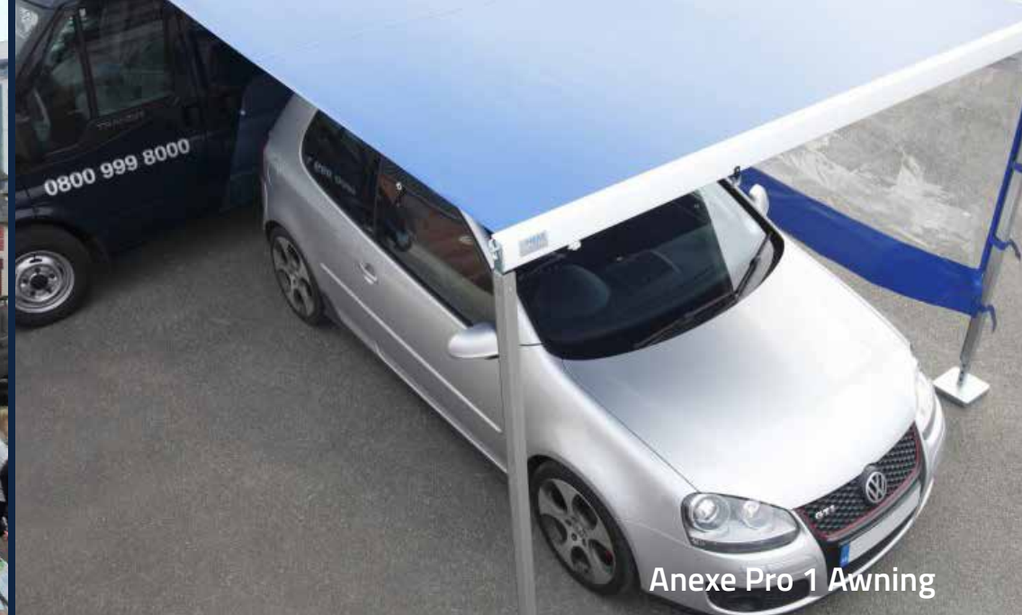
Anexe Pro 1 Awning