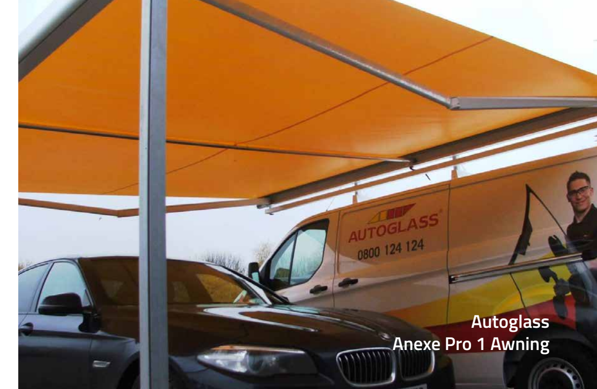
Autoglass Anexe Pro 1 Awning