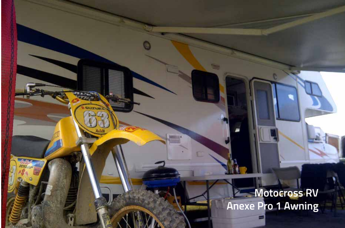
Motocross RV Anexe Pro 1 Awning

Custom branding using modern UV printing techniques is optional or you may choose traditional flat truck side quality CAD cut decals.