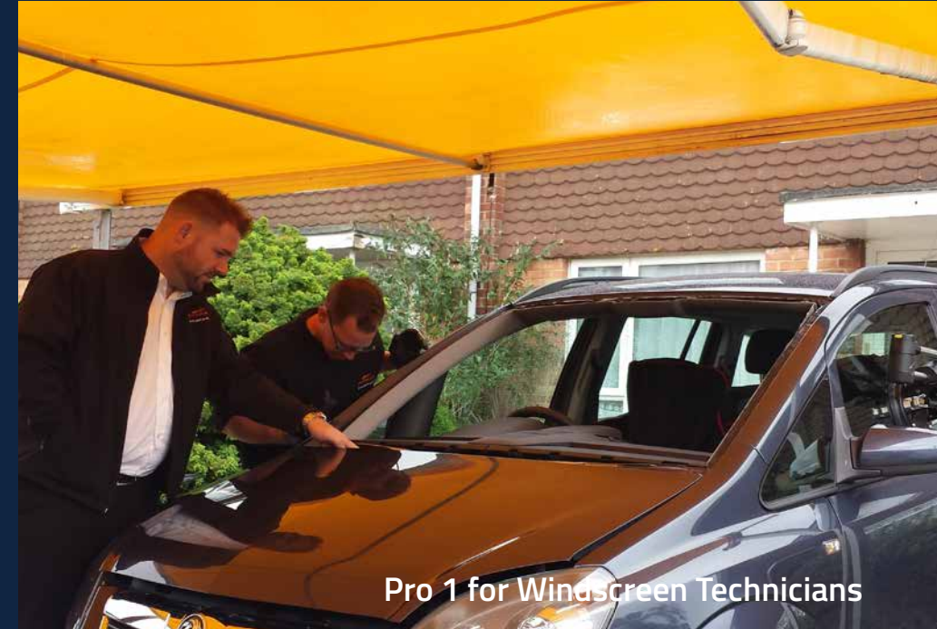
Pro 1 for Windscreen Technicians