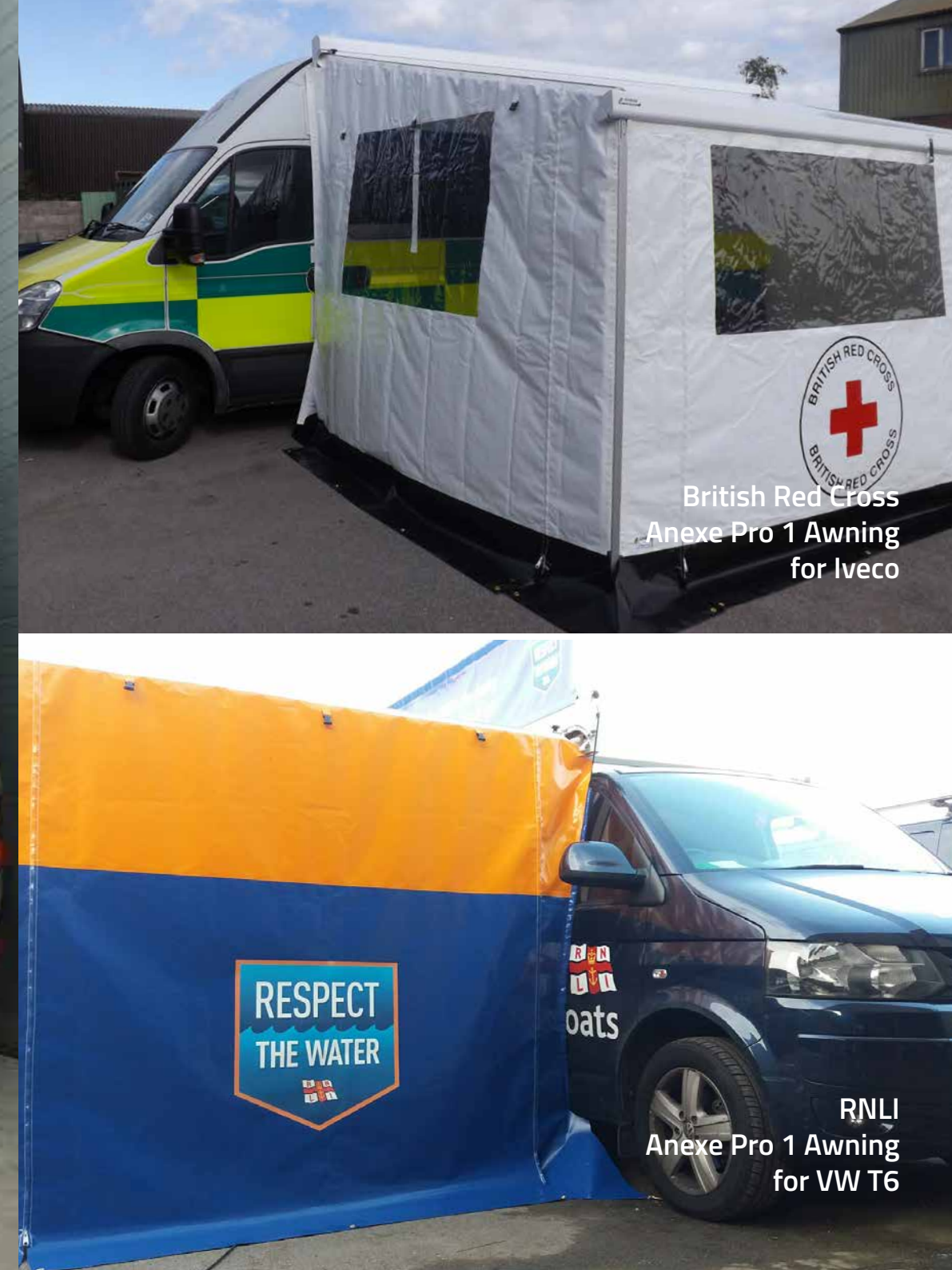
British Red Cross Anexe Pro 1 Awning for Iveco