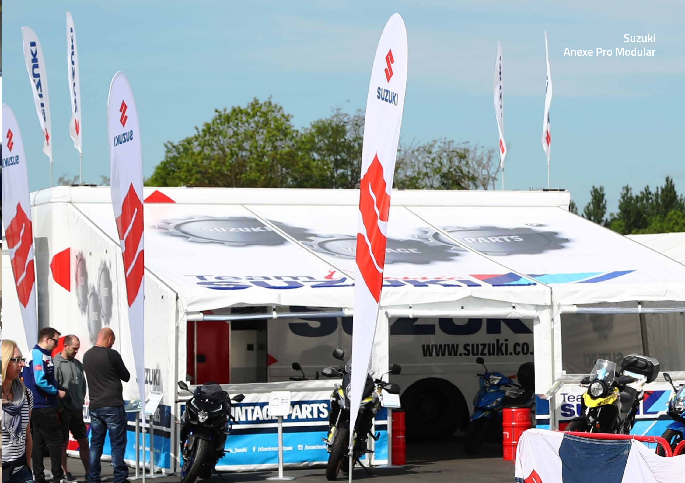
Suzuki Anexe Pro Modular